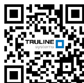
System 9000 SG Installation Guide