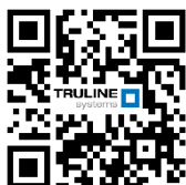
System 4000 Installation Guide