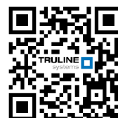
System 9000 DG Installation Guide