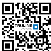
System 3000 Installation Guide

Please refer to the system specific installation guide for a complete breakdown of door frame installation by scanning the relevant QR code below.